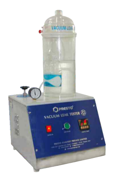
Model PVL - 0130 - PB

The Presto leak detector machine is a high quality packaging seal integrity tester that adds quality control measures to your packaging applications. Regardless of contents, the vacuum seal integrity test will help ensure that your packaged product is sealed to your specifications. Benefits of will be realized by many industries from package manufacturers and converters to end user packagers in the packaging of: Coffee, foiled cups, gels, Pouches, grains, cereal, bakery, namkeen, chips, Confectionery, snacks, pasta, frozen foods, cheese, pet food and treats, Medical and pharmaceutical , and many more.