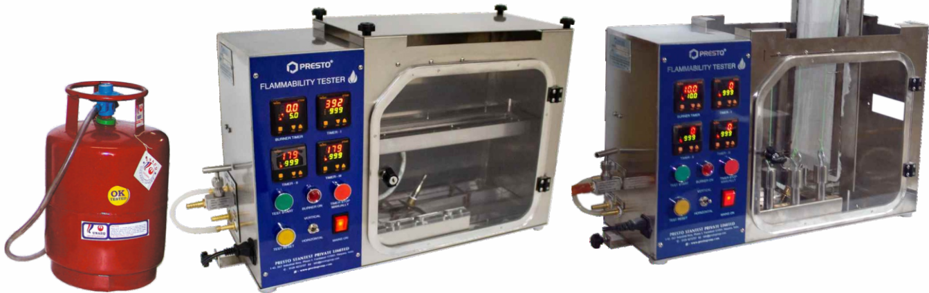
ANNEX A (Horizontal Test)